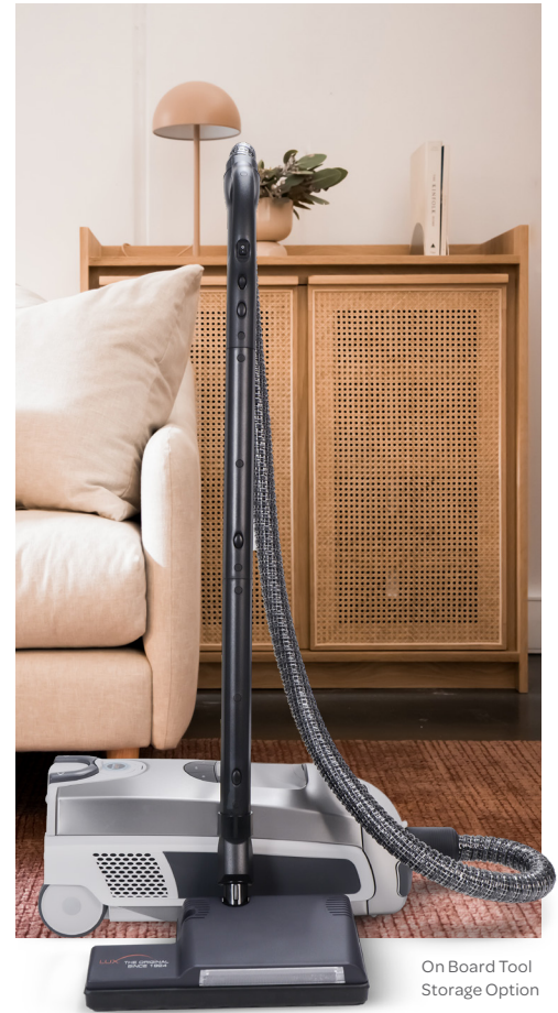
On Board Tool Storage Option

If an object becomes tangled in the power nozzle brush, the circuit breaker will automatically shut off the brush to prevent damage. A built in thermo coupler protects the motor by shutting it down if it overheats.